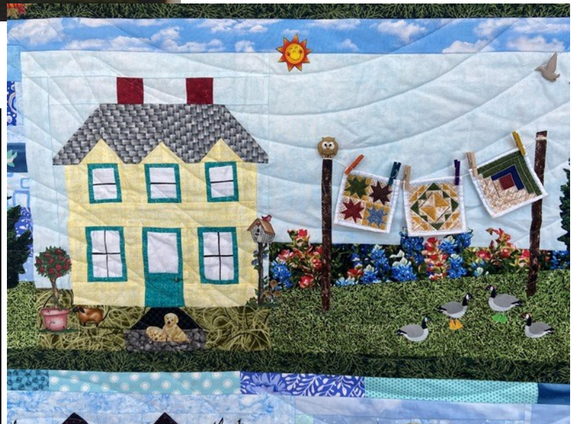
Close-up of embellishments and piecing.