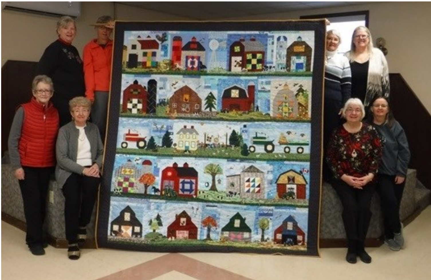
The Restoule Quilters with The Barn Quilt

This year the conference was virtual and had attendees from around the world!