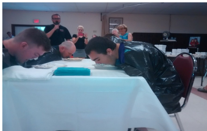
Tough going...so the tough got going!

Four clearly qualified pie eaters were seated, covered in a garbage bag from their neck down and turned loose. (No hands were allowed) All four gave an excellent account of themselves.