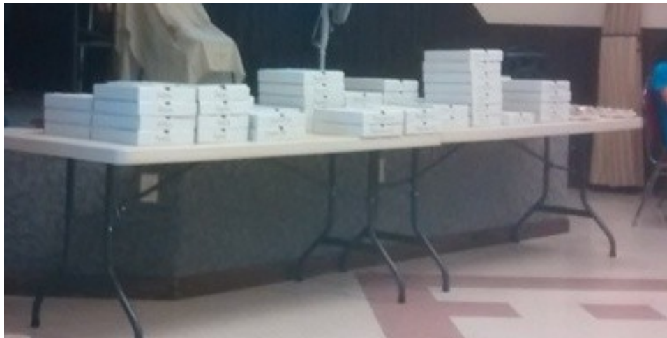
The Pies before the Auction.

Well....I don't know quite what I was expecting...but it sure wasn't that!