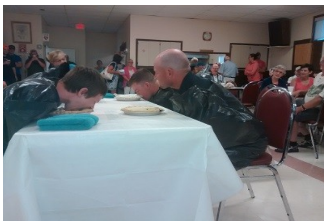
Early Round Action